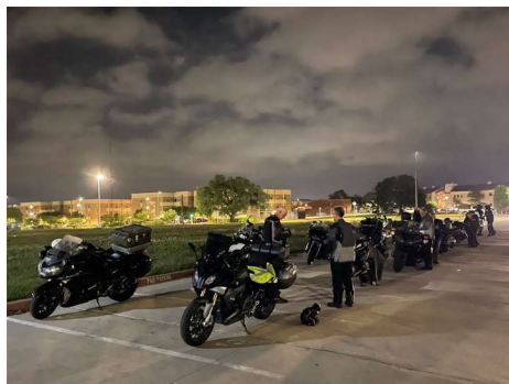
Riders Staging Area

The next morning at 5:00 am, rally staff was out in the parking lot gathering odometer readings, then having us park our bikes in a staging area until we were released.