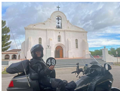
One of the El Paso Missions

From here, we rode north to I-10, then west to El Paso. There were 3 churches located here that we needed to complete the mission combo. These missions were located outside of El Paso and were easy to locate.