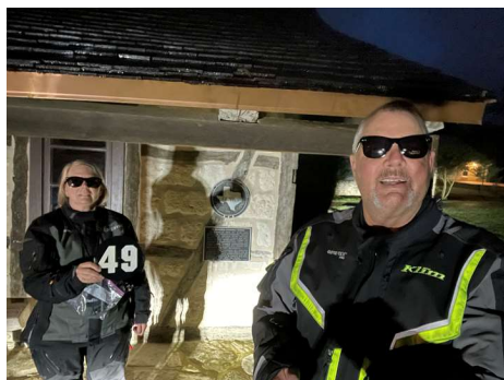
Daytime Points with Sunglasses

would give us time for our 45-minute lunch break once we arrive in College Station and before our 3:00 pm deadline.