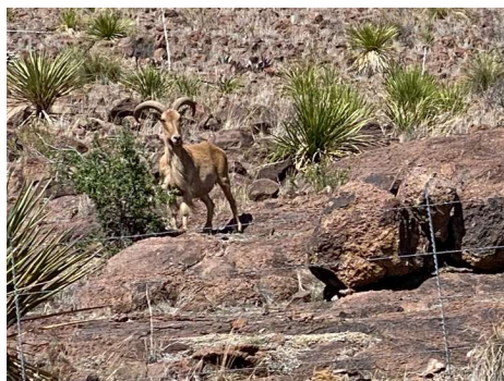
Auodad (Barbary Sheep)