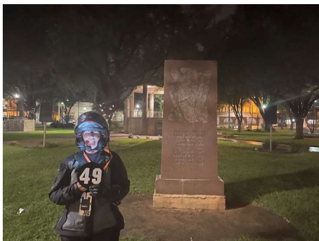
Laredo Nighttime Bonus

church bonus was only a few blocks from there!