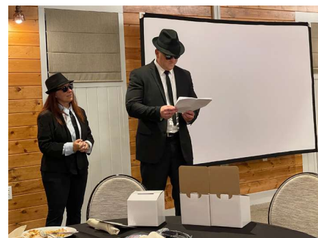
And, the Winners Are...

By banquet time, all riders had returned safe and sound! We enjoyed a great meal! Everyone had several stories to tell of the challenges they had endured over the past 4 days! It was a great time!