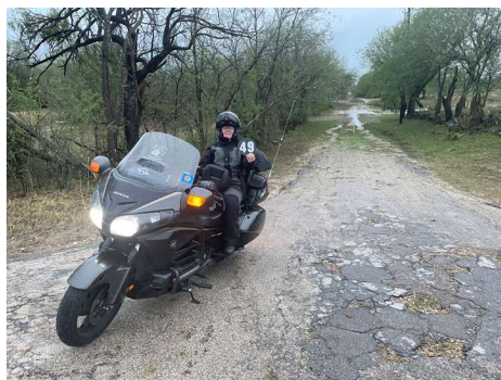
Alternate Bonus Photo