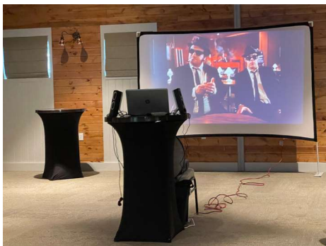
The Blues Brothers

The lights dimmed as video clips of the Blues Brothers movie started playing. This classic comedy is about brothers Jake (John Belushi) and Elwood Blues (Dan Aykroyd) getting their band back together to save the Catholic home where they were raised.